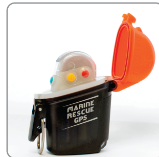
Put screws back