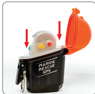
Unscrew two screws on top cap