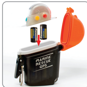
Insert two batteries (Need to install with proper orientation +, - symbols)