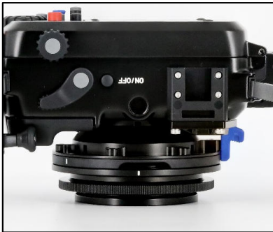
*NA-TG6 Housing with 83214 Bayonet Mount Adaptor + #81302 CMC-2

: It can directly mount on the housing. ( Full zoom range )