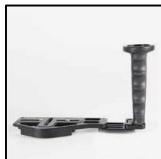
P.N. 71207 Flexitray II with left handle (with 2pcs 1/4" screws)