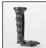
P.N. 71208 Adjustable right handle II (for Easitray II & Flexitray II)