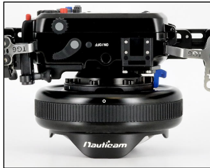
*NA-TG6 Housing with #83203 WWL-C