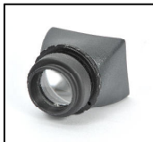
P.N. 25106 LCD Magnifier with Dioptic Adjustment