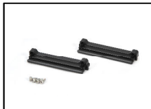
P.N. 25123 LCD Magnifier attachment rails for NA-S110/S120/TG3/G7X/G7XII/TG5/TG6