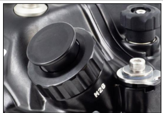
1. Unscrew M28 accessory port cap