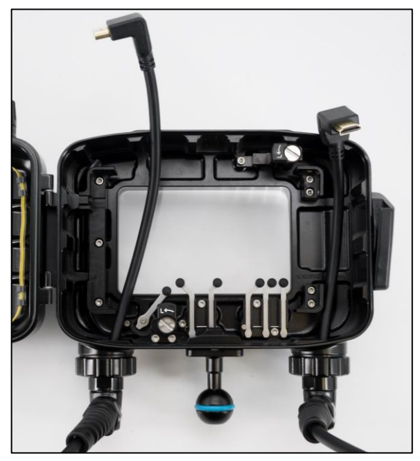
4. Repeat the above steps for another M28 accessory port if HDMI out cable is required

3. Then, tighten the HDMI 2.0 cable by turning the threaded working ring.