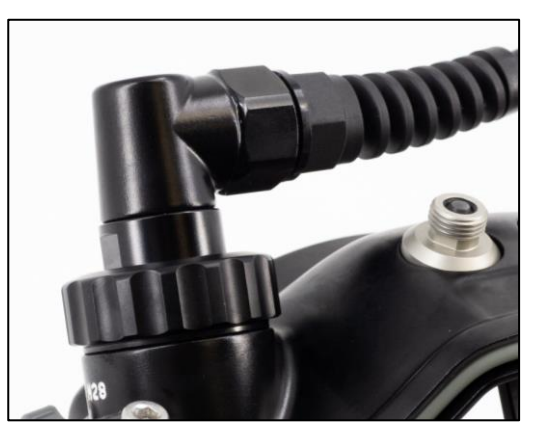
4. Then, tighten the HDMI 2.0 cable by turning the threaded working ring.

3. Gently push the cable into the M28 port opening of the housing, until it cannot go in any further.