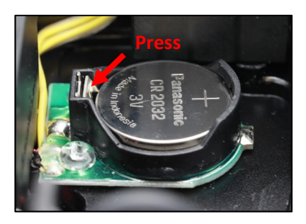
To remove the battery, press the metal plate as indicated and the battery will pop out.