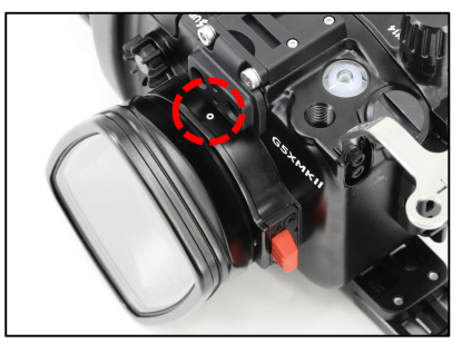
While holding the red port lock safety button, turn the port counter clockwise until the 'I' mark on the port aligns with the 'o' mark on the housing. Then gently pull the port out