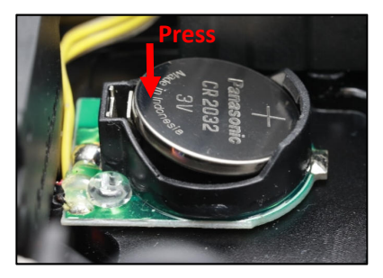
Insert the battery as shown above and then press down the battery.