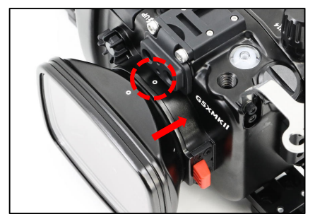
Press and hold the red port lock safety button to unlock