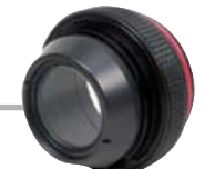
INON MRS Olympus50 Port