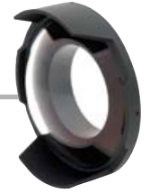
INON Dome Port Olympus+Shade 2 Set