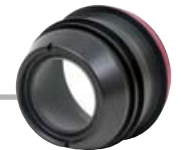
INON MRS Olympus50 Port (w/o control ring)