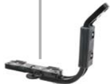
INON Grip Base D4