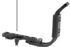
INON Grip Base M1